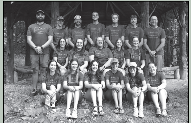
It was another great summer with a group of staff Standing on The Rock!